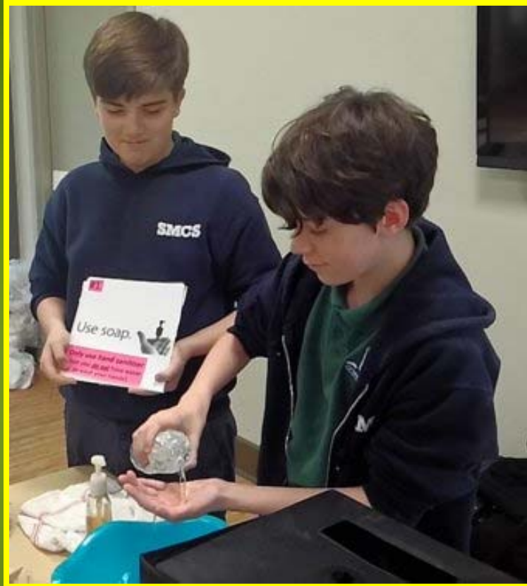
Step One~ Use Soap