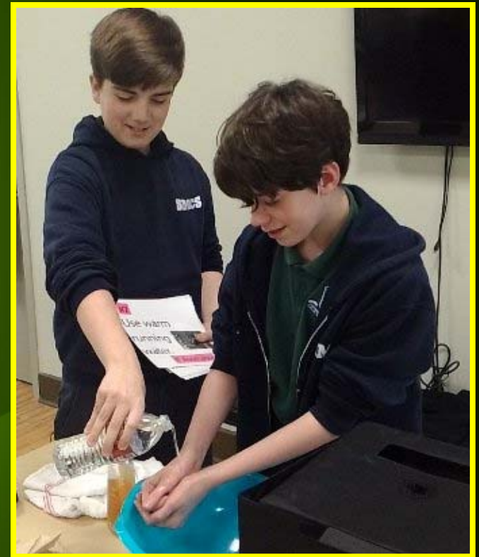
Step Two Use Warm Running Water

Only use sanitizer when water is unavailable