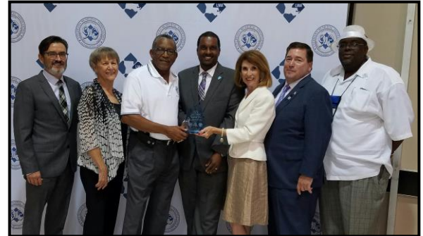
Lt. Governor's Beautification Award