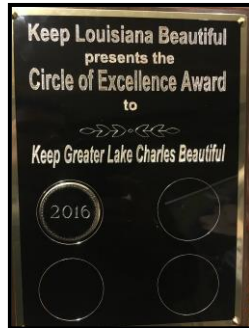
2016 Keep Louisiana Beautiful Circle of Excellence Award