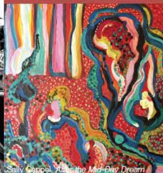
Sally Cappel, After the Mid-Day Dream