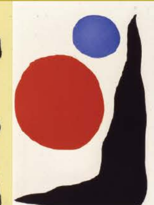
Alexander Calder, Blue and Red Ball