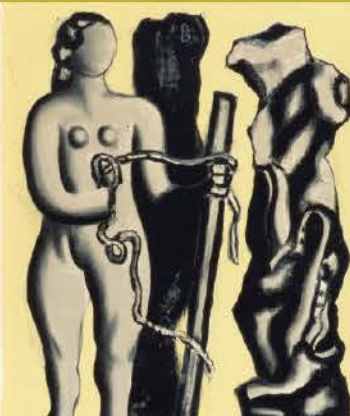
Fernand Leger, Femme sur fond rouge

"Twentieth-century art was a radically new endeavor, a total revision of acquired values and an effort to base the visual arts on revolutionary principles. Over the years, this endeavor showed an increasing audacity," —described Rene Huyghe. This exhibition of 45 original prints provides an introduction to the styles and movements of the first half of the 20th century: Cubism, Dadaism, Surrealism, Neo-Romanticism, Non-Objective art and Abstract Expressionism.